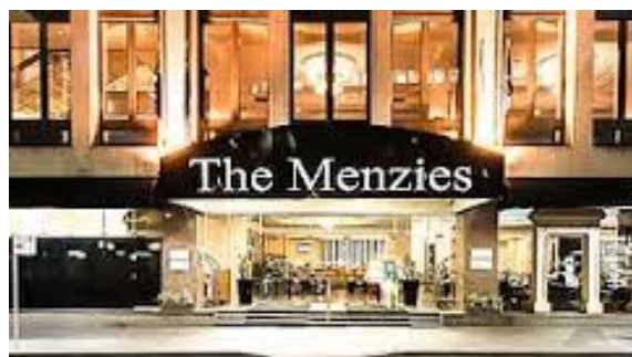
The Menzies Hotel, Sydney

The 5 th Australian Fraud Summit 2016 will bring together thought leaders in the public and private sectors to discuss new thinking in preventing, detecting and responding to fraud in an increasingly complex technological era. SRA ANZ members are eligible for a 10% discount.. Contact Akolade on +61 2 9247 6000 or email registration@akolade.com.au and quote your VIP Code: EFXRI to receive your discount