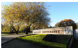
Massey University, Palm-erston North, New Zealand hosted the 8th SRA-ANZ Annual Conference, 26-27 August.